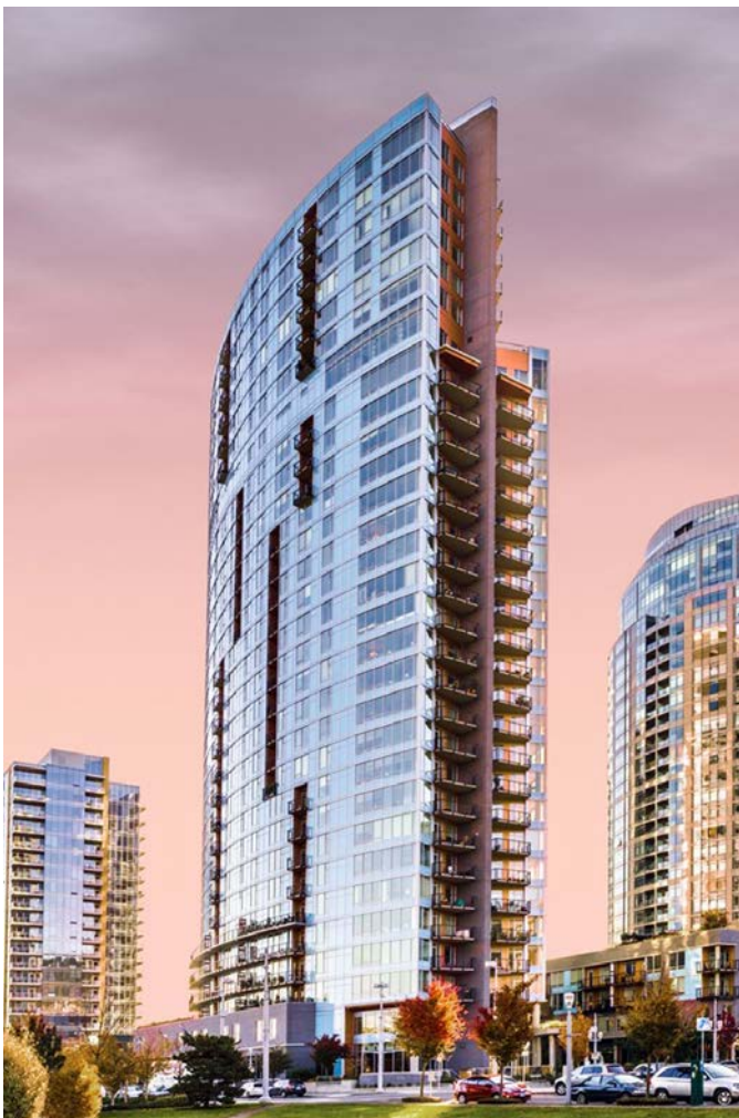
OPACI-COAT-300® Project: Mirabella, Portland, OR, USA 1 st LEED Platinum Continuing Care Retirement Community

Contact ICD High Performance Coatings + Chemistries for additional product information, accredited education, installation guides, and more.