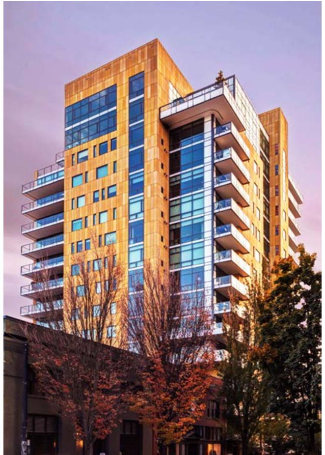
OPACI-COAT-300® Project: The Casey Portland, OR, USA 1 st LEED Platinum Highrise Condominium

USGBC or LEED does not certify building products, rather they provide a standard by which a building can be rated and certified as a green building.