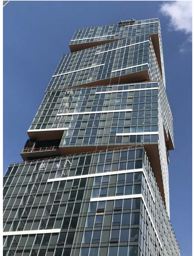
OPACI-COAT-300® Project: Nexus, Seattle, WA, USA LEED Gold Rating High Rise Condominium

OPACI-COAT-300® never contains lead or cadmium.